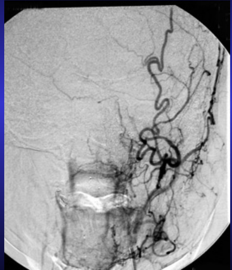
Post-embolization left ECA arteriogram