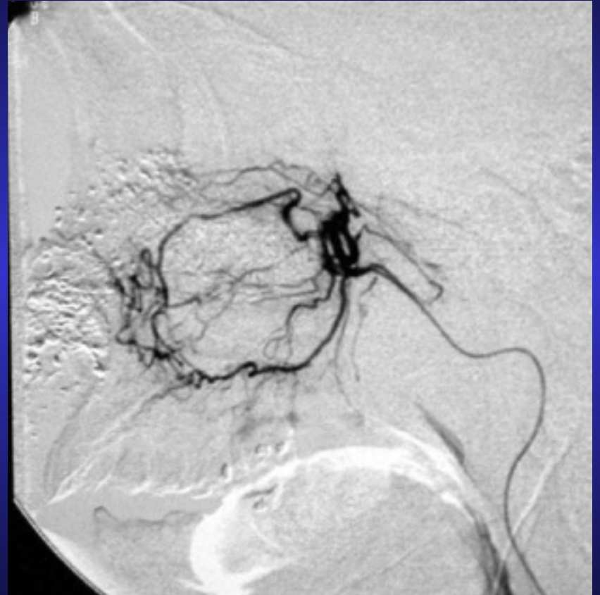
Selective left IMA arteriogram