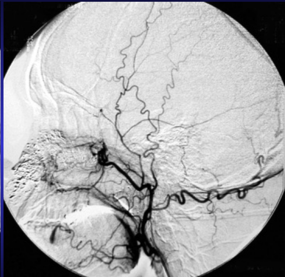
Left external carotid arteriogram